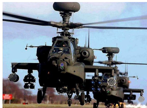
Fig. 12. The AH-64 apache.

Following the cancellation of the AH-56 Cheyenne in 1972, in favor of United States Air Force and Marine Corps projects like the A-10 Thunderbolt II and Harrier, the United States Army sought an aircraft to fill an anti-armor