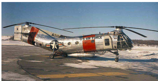
Fig. 6. The Piasecki H-21 employed tandem rotors.

Turbine engines revolutionized the aviation industry and the turboshaft engine finally gave helicopters an engine with a large amount of power and a low weight penalty. The turboshaft engine was able to be scaled to the size of the helicopter being designed so that all but the lightest of helicopter models are powered by turbine engines today.