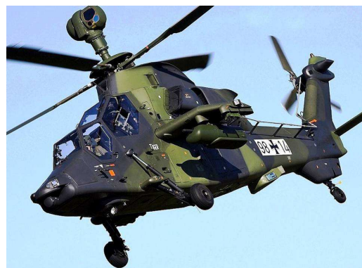
Fig. 16. The eurocopter tiger EC 665.

The X 2 first flew on 27 August 2008 from Schweizer Aircraft's (a division of Sikorsky Aircraft Corporation) facility at Horseheads, New York. The flight lasted 30 min. This began a 4-phase flight test program, to culminate with reaching a planned 250-knot top speed. The X 2 completed flights with its pusher propeller fully engaged in July 2009. Sikorsky completed Phase 3 of the testing with the X 2 hitting 181 knots in the test flight in late May 2010.