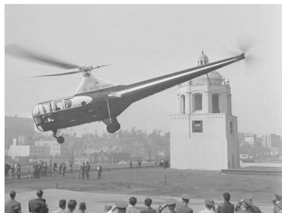
Fig. 4. First modern helicopter made by Igor Sikorsky (1947).

Reliable helicopters capable of stable hover flight were developed decades after fixed-wing aircraft. This is largely due to higher engine power density requirements than fixed-wing aircraft. Improvements in fuels and engines during the first half of the 20 th century were a critical factor in helicopter development. The availability of lightweight turboshaft engines in the second half of the 20 th century led to the development of larger, faster and higher-performance helicopters. While smaller and less expensive helicopters still use piston engines, turboshaft engines are the preferred power plant for helicopters today.