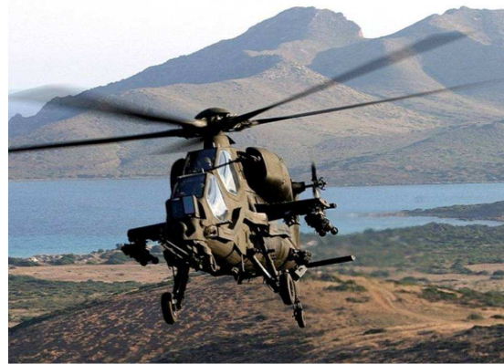
Fig. 8. Agusta A 129 Mangusta.

The AH-1 Cobra was developed in the mid-1960s as an interim gunship for the U.S. Army for use in Vietnam. The Cobra shared the proven transmission, rotor system and the T 53 turboshaft engine of the UH-1 "Huey". By June 1967, the first AH-1G Huey Cobras had been delivered. Bell built 1,116 AH-1Gs for the U.S. Army between 1967 and 1973 and the Cobras chalked up over a million operational hours in Vietnam.