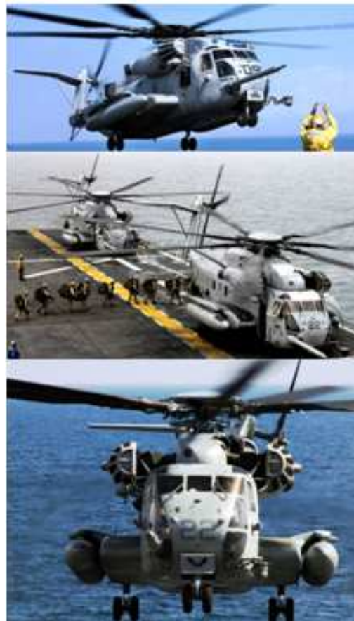
Fig. 15. The Sikorsky CH-53E super stallion.

On 4 May 2009, Sikorsky unveiled a mock-up of a Light Tactical Helicopter derivative of the X 2 .