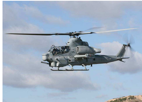
Fig. 10. The bell AH-1Z viper.

The U.S. Army is the primary operator of the AH-64, however, it has also become the primary attack helicopter of several nations it has been exported to, including Greece, Japan, Israel, the Netherlands and Singapore; as well as being produced under license in the United Kingdom as the Agusta Westland Apache. U.S. AH-64s have served in conflicts in Panama, Persian Gulf War, Kosovo War, Afghanistan and Iraq. Israel has made active use of the Apache in its military conflicts in Lebanon and Gaza Strip; while two coalition allies have deployed their AH-64s in Afghanistan and Iraq.