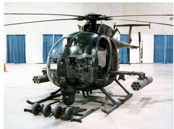
Fig. 11. The AH-6 little bird.