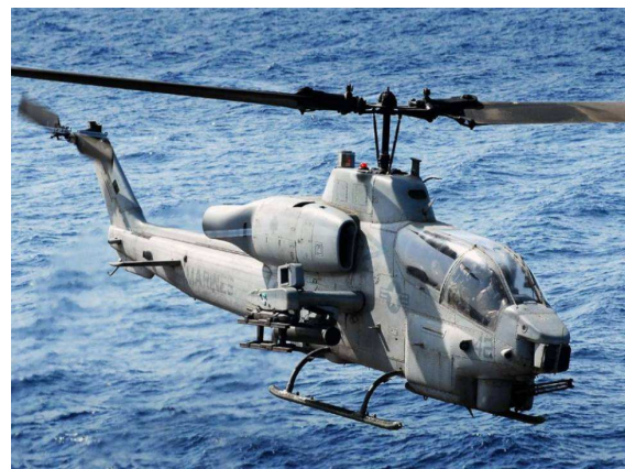
Fig. 9. The bell AH-1W super cobra is the backbone of the United States marine corps's attack helicopter fleet. Source: Petrescu and Petrescu (2011)

The U.S. Marine Corps was very interested in the AH-1G Cobra but preferred a twin-engine version for improved safety in over-water operations and also wanted a more potent turret-mounted weapon. At first, the Department of Defense had balked at providing the Marines with a twin-engine version of the Cobra, in the belief that commonality with Army AH-1Gs outweighed the advantages of a different engine fit. However, the Marines won out and awarded Bell a contract for 49 twin-engine AH-1J Sea Cobras in May 1968. As an interim measure, the U.S. Army passed on 38 AH-1Gs to the Marines in 1969. The AH-1J also received a more powerful gun turret. It featured a three barrel 20 mm XM 197 cannon that was based on the six barrel M 61 Vulcan cannon.