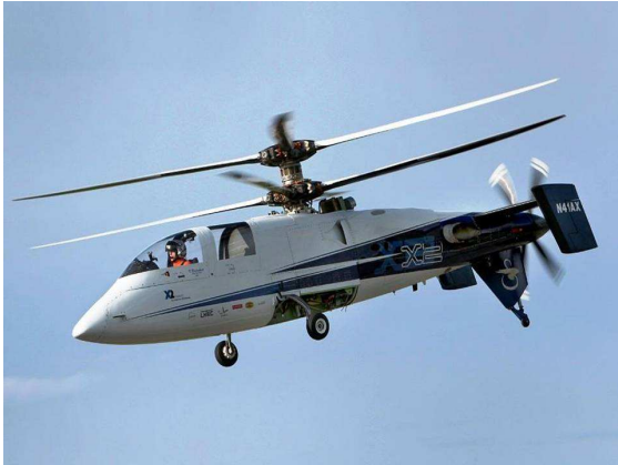
Fig. 17. The Sikorsky X 2 .

On 26 July 2010, Sikorsky announced that the X 2 exceeded 225 knots (259 mph; 417 km/h) during flight testing in West Palm Beach Florida, unofficially surpassing the current FAI Rotorcraft world speed record of 216 knots (249 mph) set by a modified Westland Lynx in 1986. The X 2 flight was purposefully made 37 years to the date of the S-69's first flight.