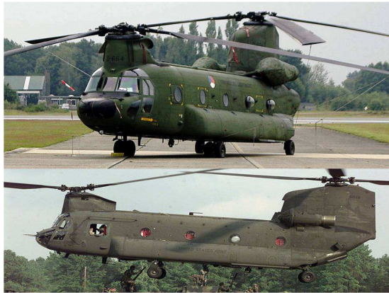
Fig. 14. The boeing CH-47 Chinook.

A commercial model of the Chinook, the Boeing-Vertol Model 234, is used worldwide for logging, construction, fighting forest fires and supporting petroleum extraction operations. On 15 December 2006, the Columbia Helicopters company of the Salem, Oregon, metropolitan area, purchased the Type Certificate of the Model 234 from Boeing. The Chinook has also been licensed to be built by companies outside of the United States, such as Elicotteri Meridionali (now Agusta Westland) in Italy, Kawasaki in Japan and a company in the United Kingdom.