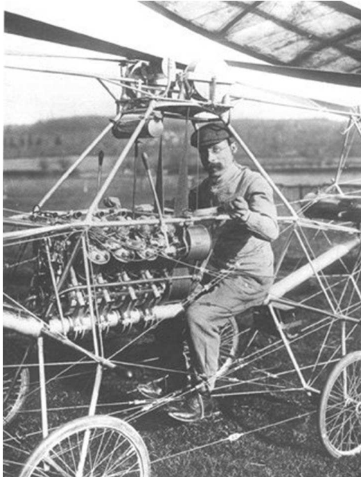
Fig. 2. The first helicopter made by the French inventor Paul Cornu (1907).