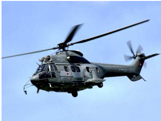
Fig. 13. The Eurocopter AS332 Super Puma.

The type has proved immensely successful, chosen by 37 military forces around the world and some 1,000 civil operators. The Super Puma has proved especially well-suited to the North Sea oil industry, where it is used to ferry personnel and equipment to and from oil platforms. In the civilian configuration, it can seat approximately 18 passengers and two crew, though since the early 2000s most oil companies have banned the use of the middle-rear seat reducing effective capacity to 17+2. This down-rating is due to difficulties encountered in evacuating through the rear-most windows in crashes at sea.