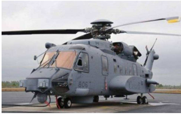
Fig. 7. CH-148 Cyclone.

The arrival of this helicopter does not mark formal delivery at this time as Sikorsky has not yet met all of the contractual delivery requirements. The helicopter will remain under Sikorsky title and control until all requirements are met.