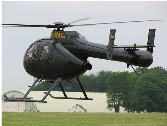
Fig. 5. MD helicopters 520 N NOTAR.